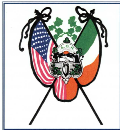
Crest of the Ancient Order of Hibernians.